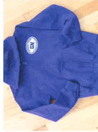
Zip Hoodie shown in Purple