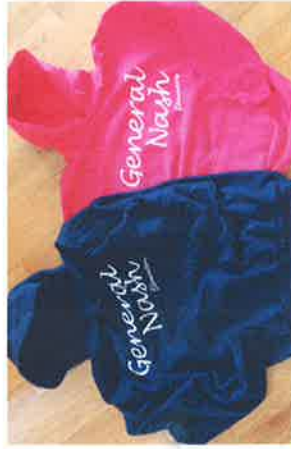
Pullover Hoodies in Navy & Pink