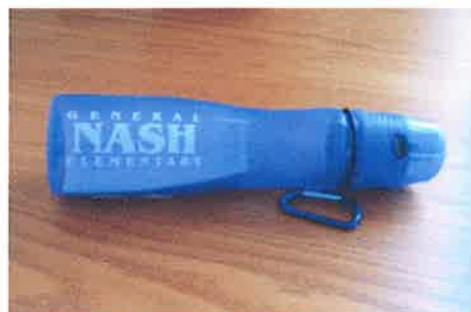
NEW Nash Water Bottle