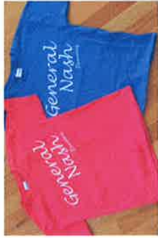
T-Shirt in Royal Blue & Pink