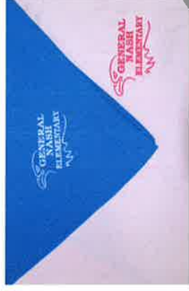
Nash Jersey Blanket